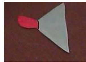
the inflated horn